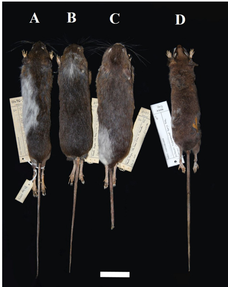
Figure 4. Cases of Piebaldism in Venezuelan mammals (Rodentia and Didelphimorphia). A, B, C. Nephelomys sp. (CVULA–I–1009, 1010, 5648), D. Marmosops carri (MZUC–868). Scale = 10 mm.

(Latitude: 7.96583; Longitude: -71.71166), 1020–1150 m a.s.l., 10–14 Km Southeastern Pregonero, Táchira State”. All have a small white spot on the dorsal region of the head. Nectomys rattus Pelzeln, 1883 (EBRG–14924), an adult male collected on September 20, 1967, in “25 Km Southeastern Puerto Ayacucho, Paria (Latitude: 5.41000; Longitude: -67.59833), 0–100 m a.s.l., Amazonas State”. It has a small white spot on the lower dorsum. Transandinomys talamancae (J.A. Allen, 1891) (MZUC–880), an adult female collected on May 22, 2011, in “El Silencio (Latitude: 10.41683; Longitude: -68.79141), 1400 m a.s.l., Yurubí National Park, Sierra de Aroa, Yaracuy State”. It has a small white spot on the nape. Ichthyomys pittieri Handley and Mondolfi, 1963 (EBRG–28236, 28237), two adult females collected on June 04–26, 1987, in “La Toma, Parque Nacional Henri Pittier (Latitude: 10.39944; Longitude: -67.68027), 1100 m a.s.l., Aragua State”. An adult male collected on May 12, 1986 in “Rancho Grande, Parque Nacional Henri Pittier (Latitude: 10.35277; Longitude: -67.68388), 1200 m a.s.l., Aragua State”. All specimens have small white spots on the dorsum.