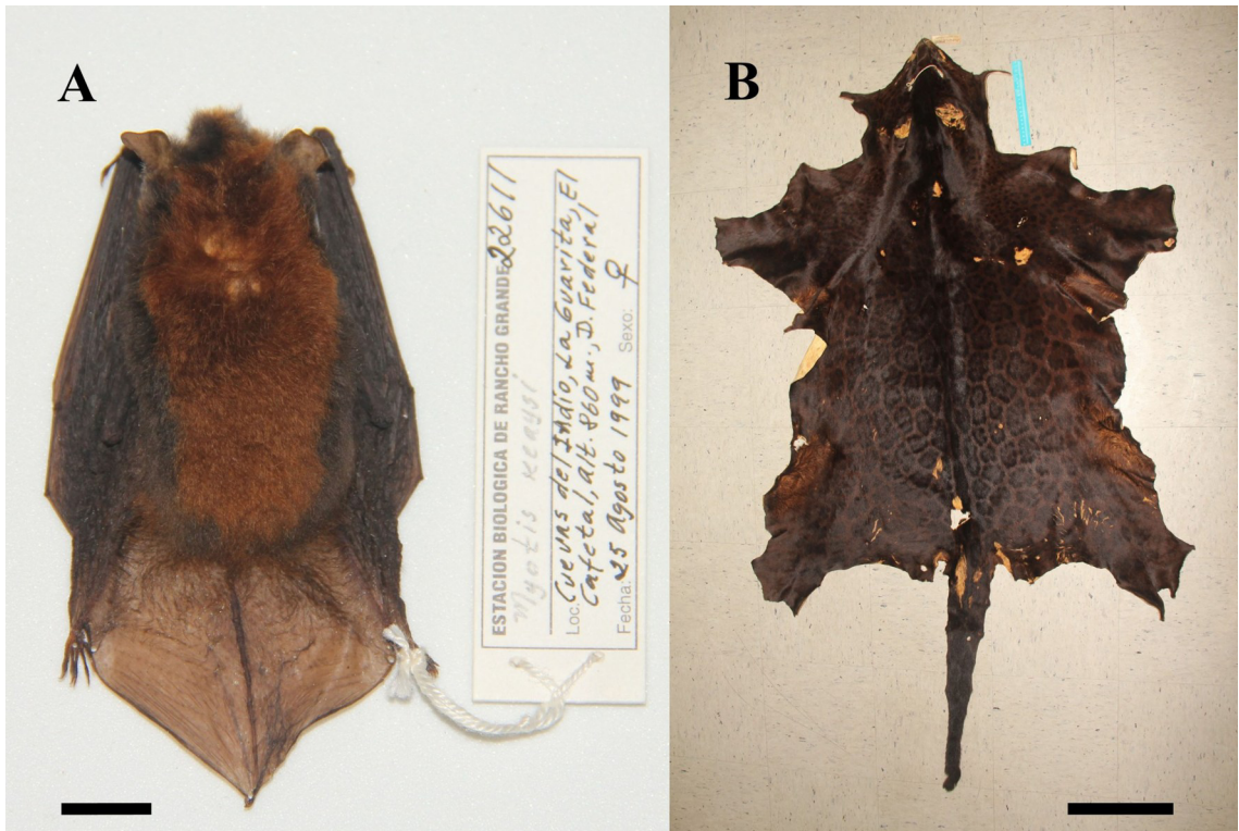
Figure 5. Cases of partial melanism and melanism in Venezuelan mammals (Chiroptera and Carnivora). A. Myotis keaysi (EBRG-22611; scale = 10 mm). B. Panthera onca (EBRG-4486; scale = 200 mm).

CARNIVORA Bowdich, 1821, Felidae Fisher, 1829, Panthera onca (Linnaeus, 1758) (EBRG-4486): an adult individual (unknown sex), collected on November 17, 1993, in “Campo florido (Latitude: 5.41000; Longitude: -67.59833), 0–100 m a.s.l.. Aproximadamente 70 Km Sur de Puerto Ayacucho, Departamento de Atures, Amazonas State” (Figure 5). An adult male (EBRG-17032), collected on June 1983, in “Río Hacha (Latitude: 4.36926; Longitude: -61.69055), 400 m a.s.l., Bolívar State”. Both specimens have a blackish coloration.