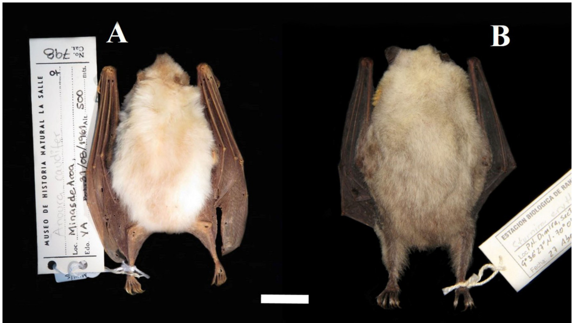
Figure 3. Cases of leucism in Venezuelan mammals (Chiroptera). A. Anoura caudifera (MHNLS-798). B. Sturnira erythromos (EBRG-24426). Scale = 20 mm.