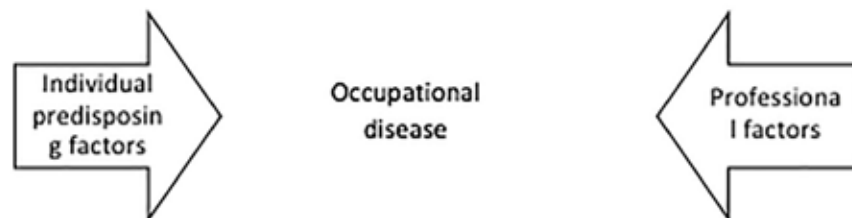
Figure 1. Disease factors (26).

the health of the worker, since when negative work situations that are generated within organizations cause occupational diseases, they diminish the well-being of the person and therefore directly affect your health. On the other hand, work-related illnesses are derived from the relationship between individual predisposing factors and from a professional factor that displays a favorable influence in relation to work conditions (26) (Figure 1).