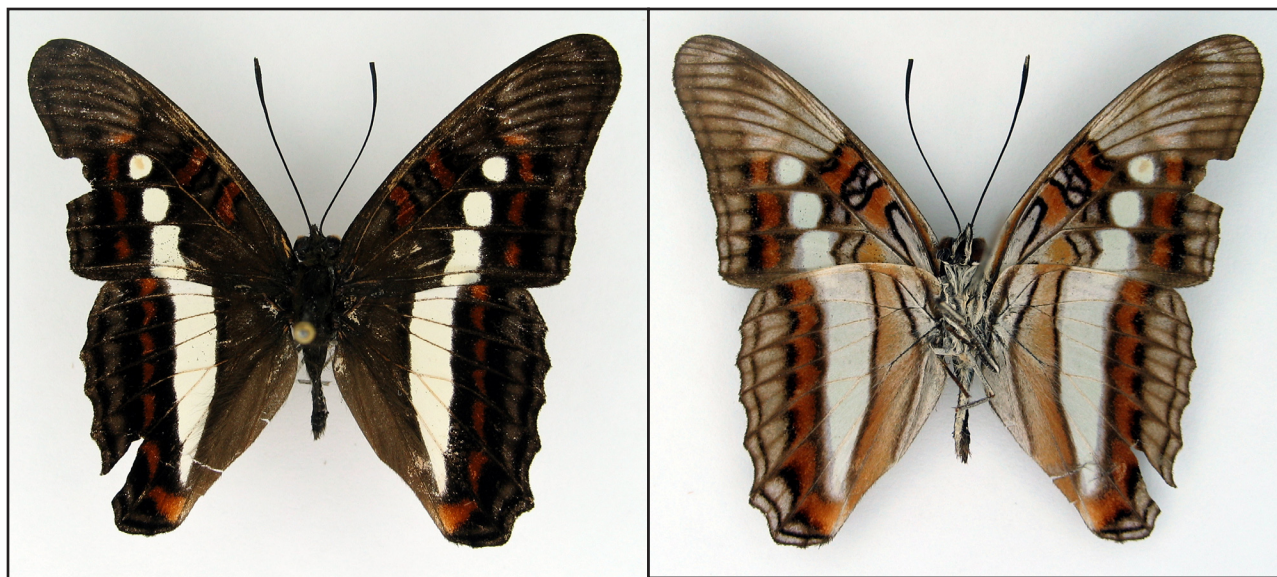
Figure 1. Recto and verso of Adelpha seriphia barcanti male

one occasion (July 2005), under suitable weather conditions, could we reach the top of Cerro Quiriquire, located west of San Antonio (Estado Monagas), locally known as Cerro Piedra de Moler. A telecommunication tower is located on top of Cerro Quiriquire; a dirt service road, beginning at the nearby town of San Antonio, allows access to an excellent patch of rainy forest at 1850 m. The very top of the Cerro Quiriquire, however, has a certain degree of human intervention: some small buildings, the tower, and an oil-powered generating plant, constantly working and producing acoustic and chemical contamination.