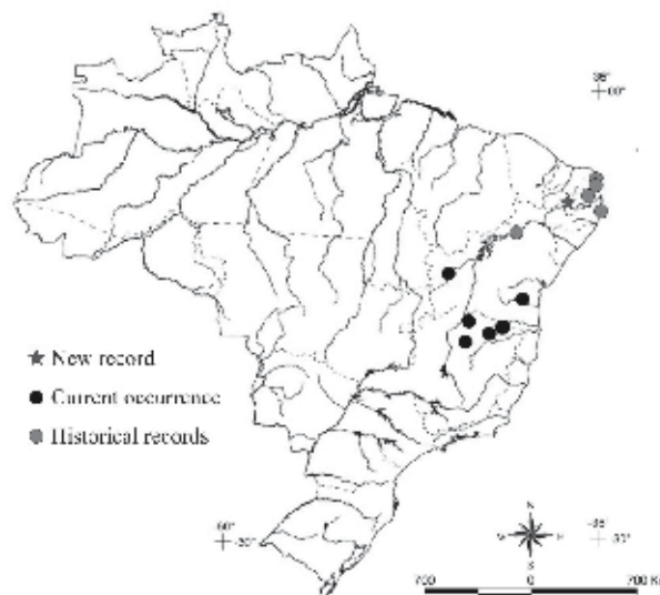
Figure 2. Distribution map of Megasoma gyas rumbucheri and new record from Private Reserve for the Environmental Inheritance of Fazenda Almas, State of Paraíba, Brazil. Modified from Grossi et al. (2008).