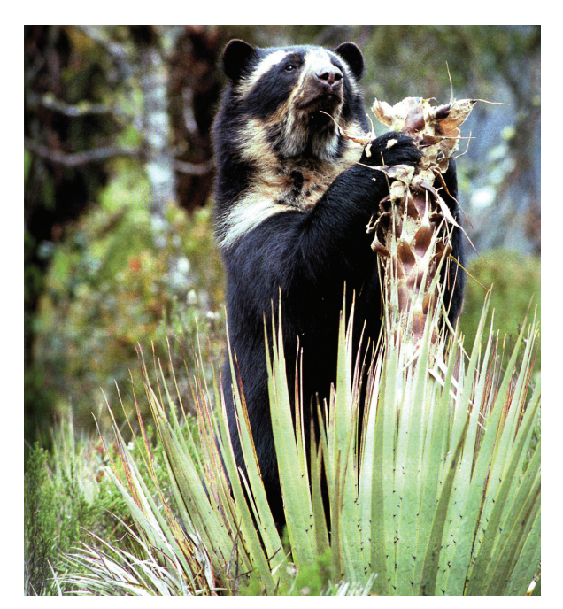
Fig. 4. An "oso frontino" (Andean bear) in the process of devouring a plant of Puya aristeguietae.

Distribution and ecology: Puya guaramacalana is known only from a small, approximately ½ ha population restricted to an exposed, rocky slope in the isolated Páramo El Pumar, which is in the south-western part of Guaramacal National Park in Trujillo State, Venezuela. This population (as well as the species) appears to be threatened by the "oso frontino" or Andean bear ( Tremarctos ornatus F.G. Cuvier 1825), which consumes the young leaf buds and flowering shoots. Anecdotal evidence (Ramón Caracas, pers. observ.) suggests that the bear's preferred food P. aristeguietae (Fig. 4, Goldstein 1999), which was once common within the Park, has been virtually eliminated by over feeding and as a consequence these herbivores have increased their pressure on P. guaramacalana . These observations suggest that P. guaramacalana is Critically Endangered (CR2b(v)) following IUCN criteria (IUCN 2001) because this new species has a limited range and the consumption of plants by bears will lead to a decline in the number of mature individuals