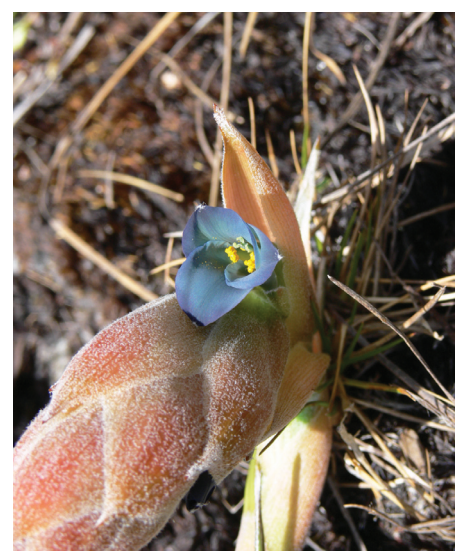
Fig. 3. Flower of Puya guaramacalana showing the relative position at anthesis of floral bracts, petals, anthers, and stigma.

Paratypes: VENEZUELA. TRUJILLO: Municipio Boconó, Parque Nacional Guaramacal, slope forests of El Pumar, SE of Boconó, (UTM: 19-364614E; 1021651N), 2600 m elevation on old mule trail to caserio de Guaramacal, in páramo, 27/12/2000, B. Stergios, L.J. Dorr & S.M. Niño 18873 (PORT, US); Parque Nacional Guaramacal, Páramo El Pumar, lomerío paramero pedregoso abierto, 2600 m snm, 15/04/2014, B. Stergios, R. Caracas, A. Bencomo & M. Hidalgo 21774 (IVIC, MER, NY, PORT, SEL, US, VEN).