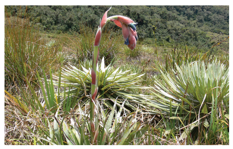
Fig. 2. Habit and habitat of Puya guaramacalana.