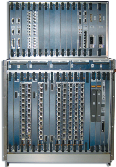
Marconi OMS 2450