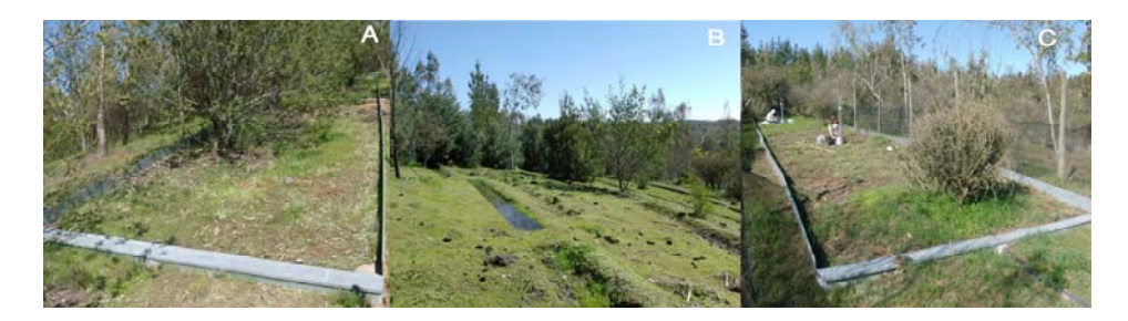
Figure 1. Photo of the different treatments, with a) subsoiling, b) infiltration trenches and c) natural prairie.