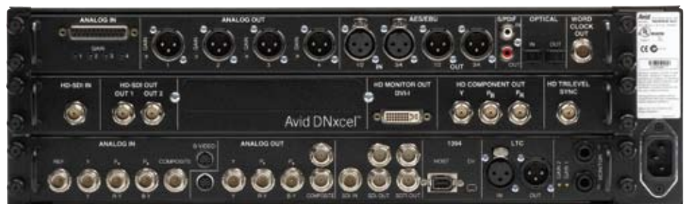
Avid Adrenaline (shown with optional Avid DNxcel board)

Providing faster return on your investment by getting your systems and personnel up and running quickly, maximizing workflow efficiency, and meeting your production schedules. To learn more about Avid Total Services, please visit: www.avid.com/services .